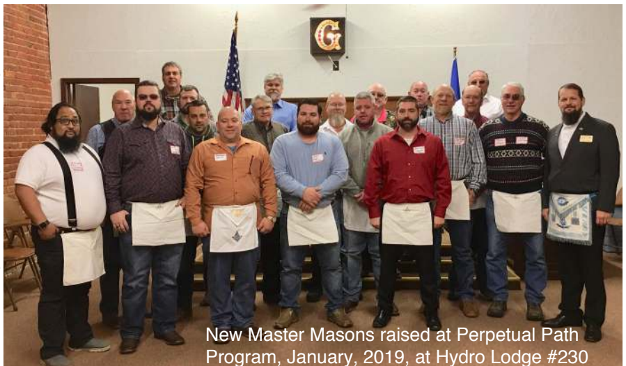
New Master Masons raised at Perpetual Path Program, January, 2019, at Hydro Lodge #230

All required forms are available on the Grand Lodge website: http://www.gloklahoma.com/ Candidate form link: http://www.gloklahoma.com/wp-content/uploads/2016/03/Fillable-PPP-Person-App.pdf Lodge hosting form link: http://www.gloklahoma.com/wp-content/uploads/2016/03/Fillable-PPP-Host-App.pdf Perpetual Member Application: http://www.gloklahoma.com/wp-content/uploads/2017/03/PP.pdf