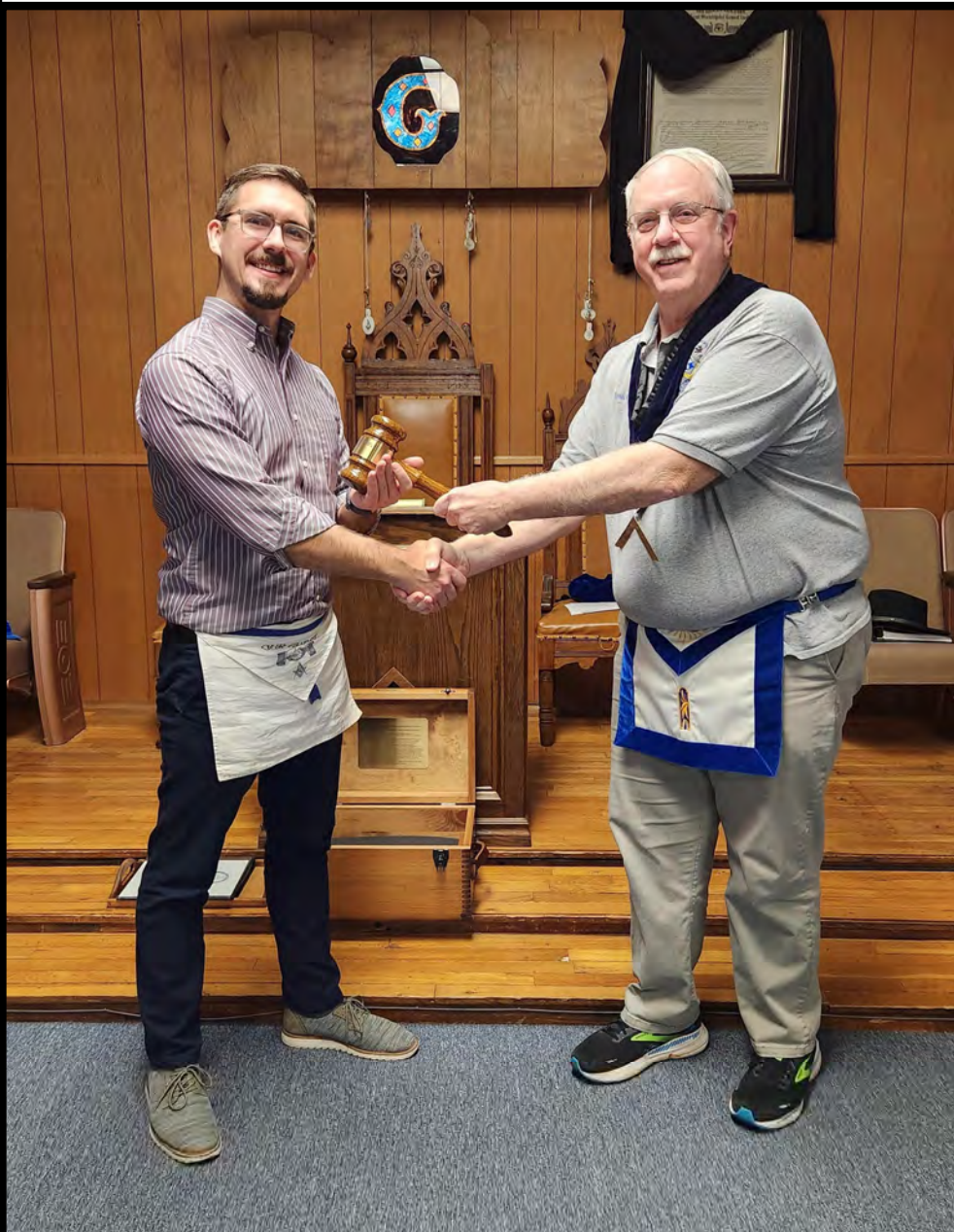
Capture of Myrtle Lodge Jachin Gavel by Siloam Lodge #276 At Edmond Lodge #37