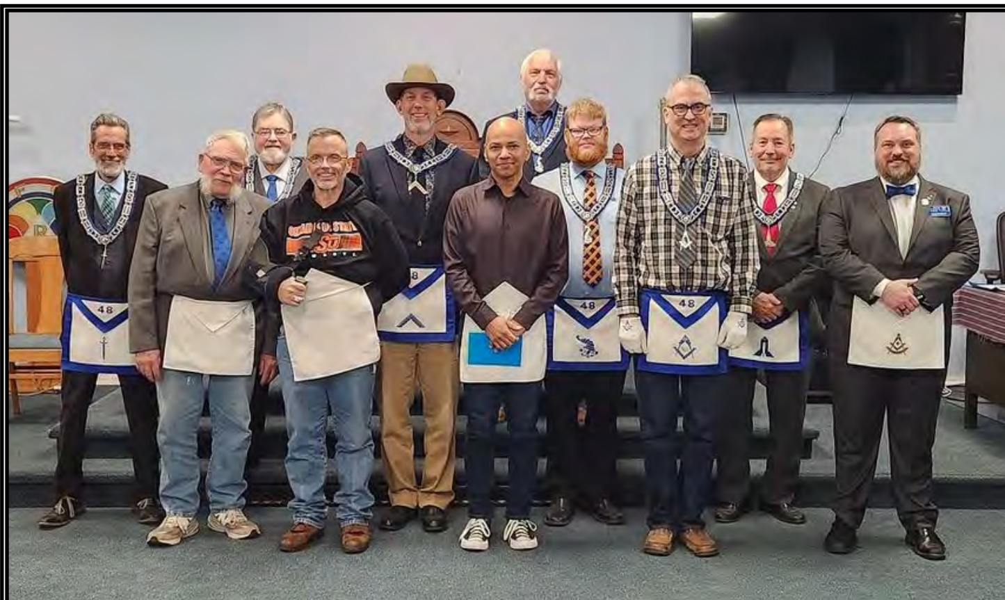
Two new EAs at Frontier Lodge #48