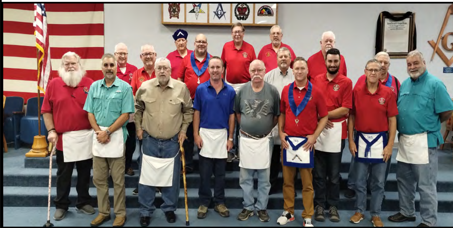
New Master Mason at Myrtle Lodge #145