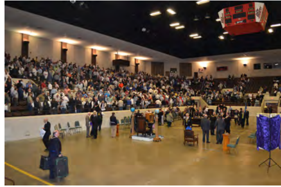
"Lodging" for the day.

Akdar Lodge - 39 Candidates Allen Lodge - 32 Candidates Pilgrim-Rock Lodge - 28 Candidates Wilburton Lodge - 27 Candidates Will Rogers Lodge - 24 Candidates Catoosa Lodge - 22 Candidates Moore Lodge - 20 Candidates